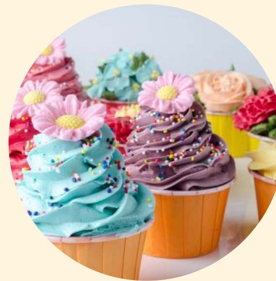
Party's & Snack